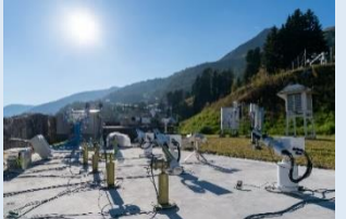
field measurements at Davos

The objective of this campaign was to compare different instruments belonging to different global or national networks in order to quantify the main factors that are responsible from possible deviations. The whole activity aims to a homogenization of the Aerosol Optical Depth (AOD) measurements in a global scale .